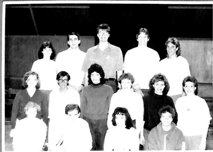
EK joins together for its final group picture.