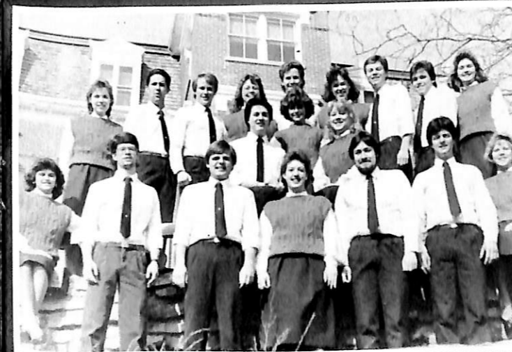
The Dana College New Day poses before Old Main.